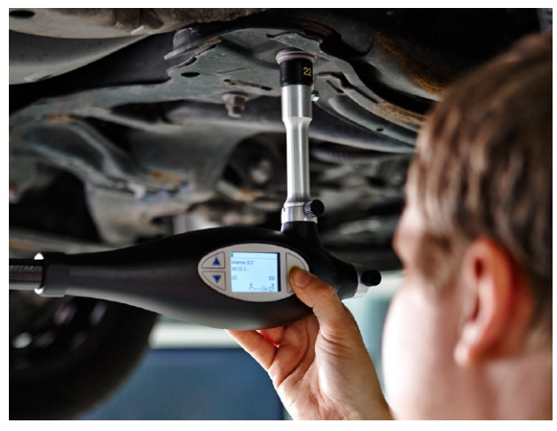
One technician can easily manage the entire diagnosis

Vision2 - PointX has an easy-to-learn workflow presented in a user-friendly interface. All these features working together contribute to reduced cycle times and more efficient diagnosis.